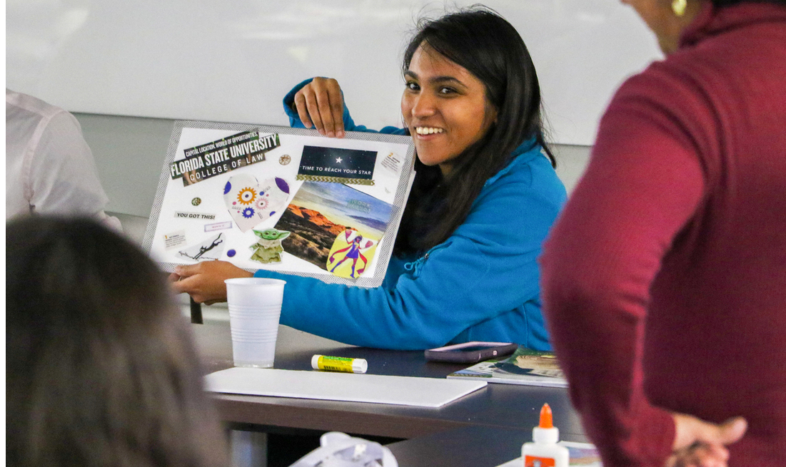
In January 2020, the FSU Law Office of Student Advancement hosted a vision board party as part of their Wellness Wednesday series.

For the second year in a row, FSU has been ranked the #3 law school in the nation for best quality of life. The ranking, which is published in Princeton Review's Best Law Schools for 2021 list, is based on students' answers to survey questions, including how they rate the beauty, safety and location of their campus, campus dorms and food, ease in getting around campus and in dealing with the administration, the friendliness of fellow students and interactions among different student types on campus, and overall happiness. Princeton Review surveyed 143,000 students at 386 schools for its 2021 list.