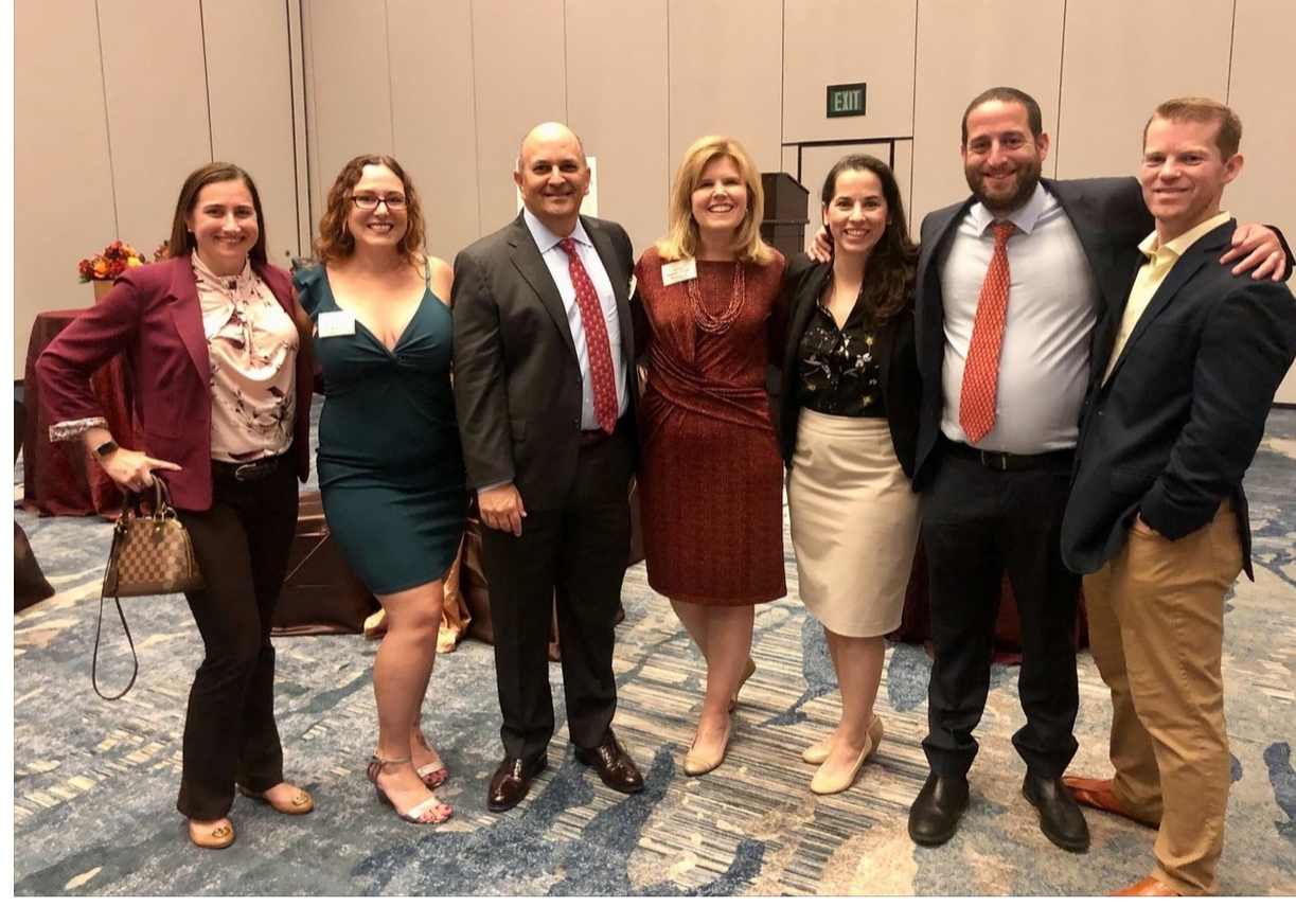
Alumni at the FSU Law reception during the Annual Florida Bar Convention