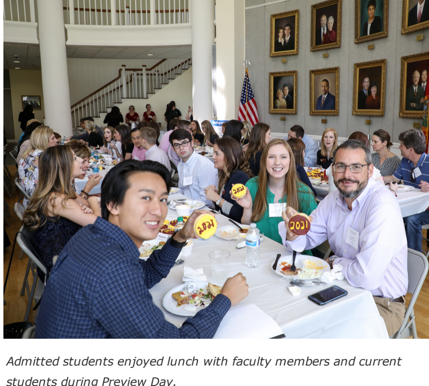
Admitted students enjoyed lunch with faculty members and current students during Preview Day.