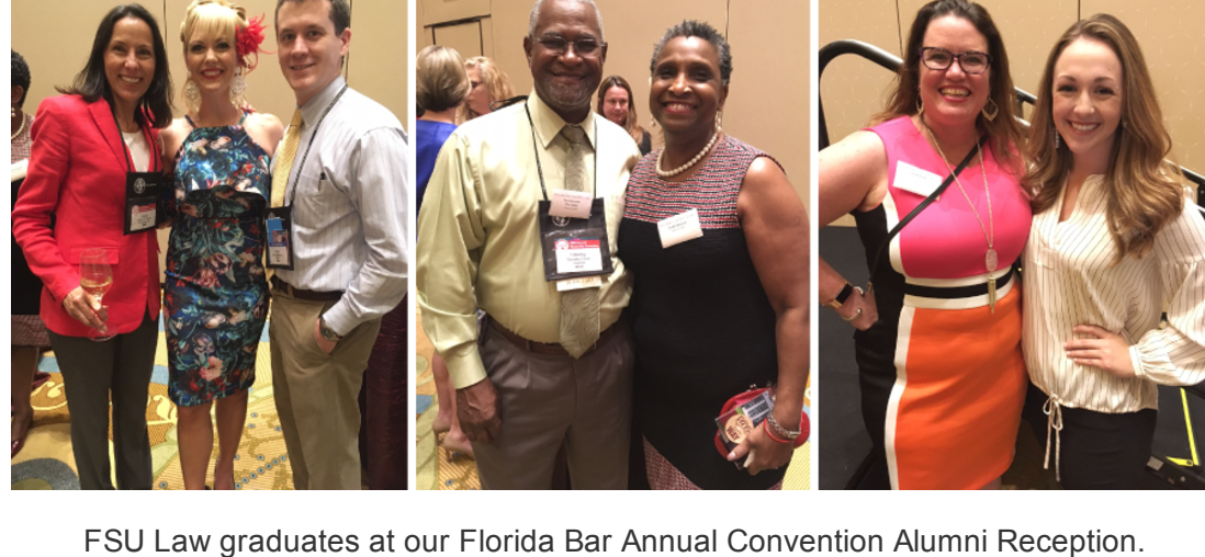
FSU Law graduates at our Florida Bar Annual Convention Alumni Reception.

Last week, we were delighted to connect with many alumni at The Florida Bar's Annual Convention in Orlando. It was a wonderful opportunity to discuss business at our Alumni Association Board Meeting and to network at our Alumni Reception, both of which are annual events at the convention. Thank you to all of our FSU Law family and friends who included us in their convention plans! During our events, we introduced our "Pave the Way" fundraising campaign with a new video that highlights the importance of giving to FSU Law student scholarships. Through the campaign, we aim to raise $2 million for scholarships. Your support will allow us to recruit talented and diverse students, and will increase the value of an FSU Law degree. You can view the video and learn more about giving to scholarships on our website. We hope you will join us in Paving the Way!