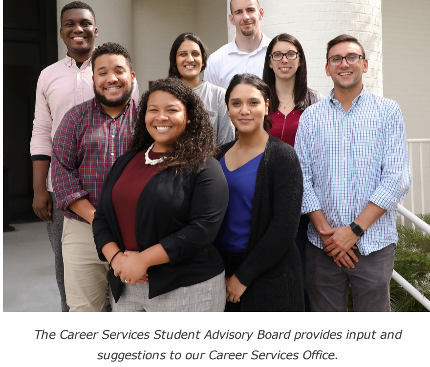
The Career Services Student Advisory Board provides input and suggestions to our Career Services Office.

Our Career Services and Professional Development team relies on valuable input from alumni and other employers about our career services efforts. Feedback and suggestions are critical to our mission of offering law students and graduates a collaborative approach to professional development and employment search strategies. As many of you interview our students this spring – either through our currently open On-Campus Interview Program , through advertising with a “Job Posting” or through a “Resume Collect” – we hope you will tell us where we are succeeding and how we can better assist you in considering and hiring our students. To integrate much-needed student perspectives, we have introduced a Career Services Student Advisory Board. Just as we welcome alumni feedback, we believe student viewpoints are equally as important to developing our programming, employer outreach and career advising strategies. Thank you to everyone who is advising us as we help launch careers! Please note that the fall On-Campus Interview season will commence August 5 and we hope to see many of you in Tallahassee to meet our students.