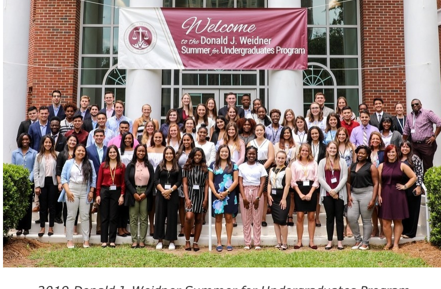
2019 Donald J. Weidner Summer for Undergraduates Program participants