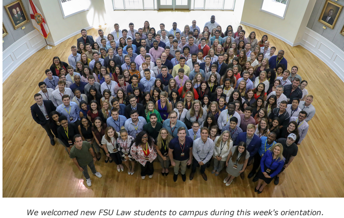
We welcomed new FSU Law students to campus during this week's orientation.