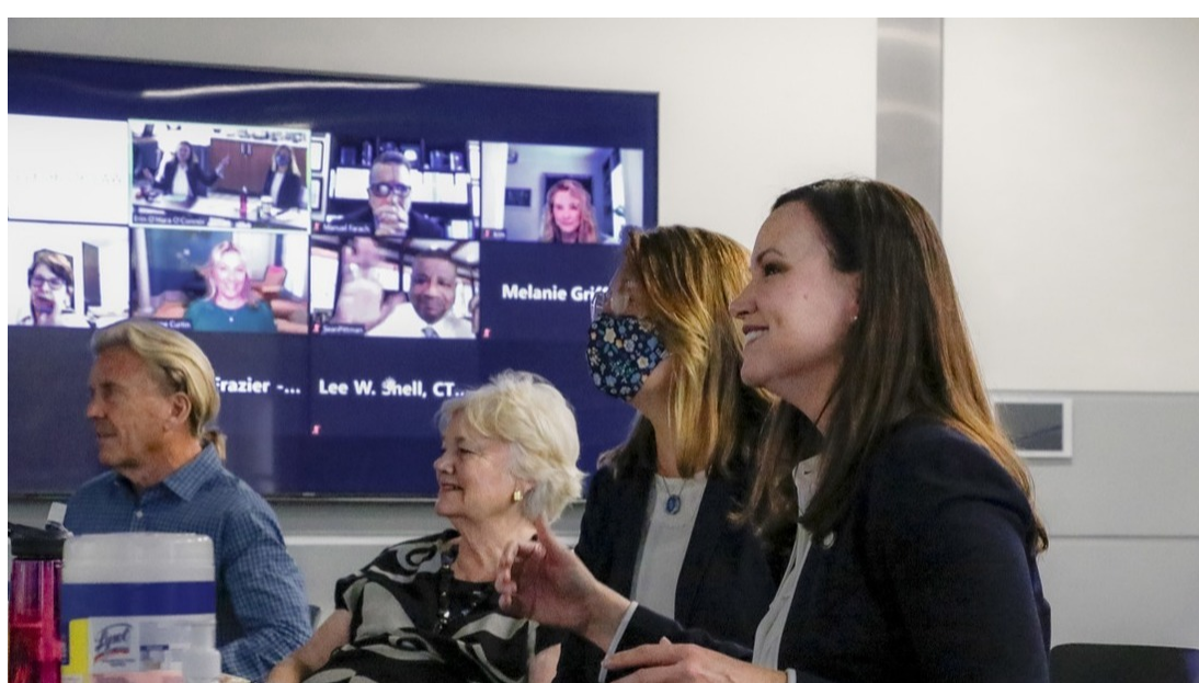
Attorney General Ashley Moody speaks with Board of Visitors members.

On Monday, Florida Attorney General Ashley Moody visited the law school to speak with alumni serving on the FSU Law Board of Visitors. Moody discussed her career path and how she is using lessons learned in practice and on the bench to make Florida a stronger state; rewarding aspects of serving as the state's chief legal officer; some of the projects on which the Attorney General's Office is currently working—including advocating for legislation to better protect the state's seniors—and the unique partnership her office has with FSU Law.