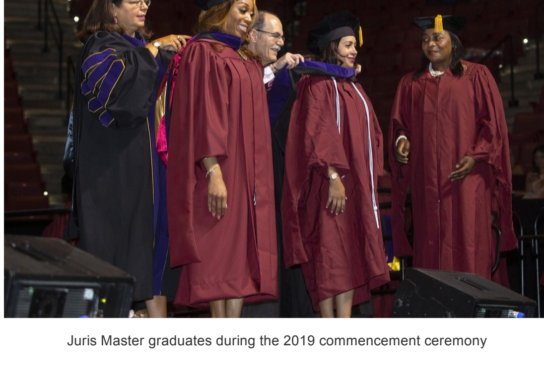
Juris Master graduates during the 2019 commencement ceremony

When we launched our online Juris Master Program several years ago, we could not have anticipated the huge growth it would see in its first years. This spring, 42 students earned their J.M. degrees, bringing the total number of program graduates to 222. Currently, 452 students are enrolled in the master's program, and the number of new students enrolling has continued to increase each semester. In addition to expanding the program's enrollment, we recently added a new concentration to the program—the Cybersecurity, Privacy, and Technology Risk Management Concentration launched this summer and we are currently accepting applications for the fall semester. Students will gain a strong foundation in U.S. and foreign laws and regulations governing cybersecurity, privacy, intellectual property, data science and artificial intelligence. They will also learn about pertinent contract law issues, including basic contract law, IP licensing law, government and defense contracting, and legal and risk management issues relevant to managing portfolios of contracts. With this new concentration, students now have five concentrations from which to choose when enrolling in our online master's program: