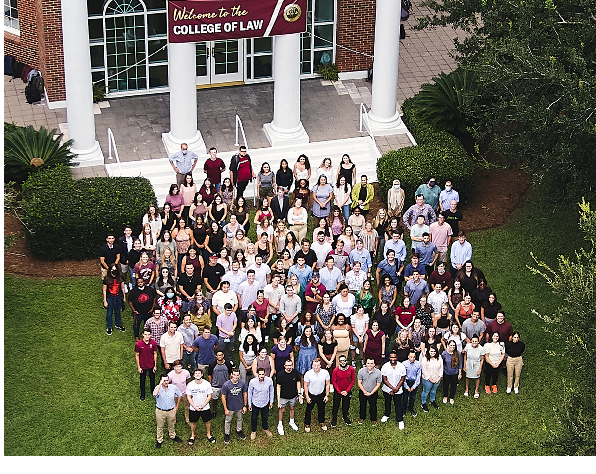
FSU Law Class of 2024

This week, we began the fall 2021 semester and welcomed students back to campus for fully in-person classes. We were especially excited to have our new 1L class join us. This is an impressive group of 158 students, boasting a median LSAT score of 163 and a median GPA of 3.82—both of which are records at FSU Law! In addition, this class is setting a record with the highest percentage of female students in an incoming class at 59.5%. The group is extremely diverse—students range in age from 19-61, 39% identify as ethnically/racially diverse, and 29% are non-Florida residents. The class of 2024 has a combined 637 years of work experience and majored in 43 different subjects at 58 undergraduate schools. Additionally, 6% of the class has already earned a graduate or professional degree. When I welcomed the class at orientation last week, I urged them to embrace the differences within their group and encouraged them to learn from the many points of view that they would encounter during their classes. It was a joy to meet them and teach them last week, and we are looking forward to watching them flourish at FSU Law!