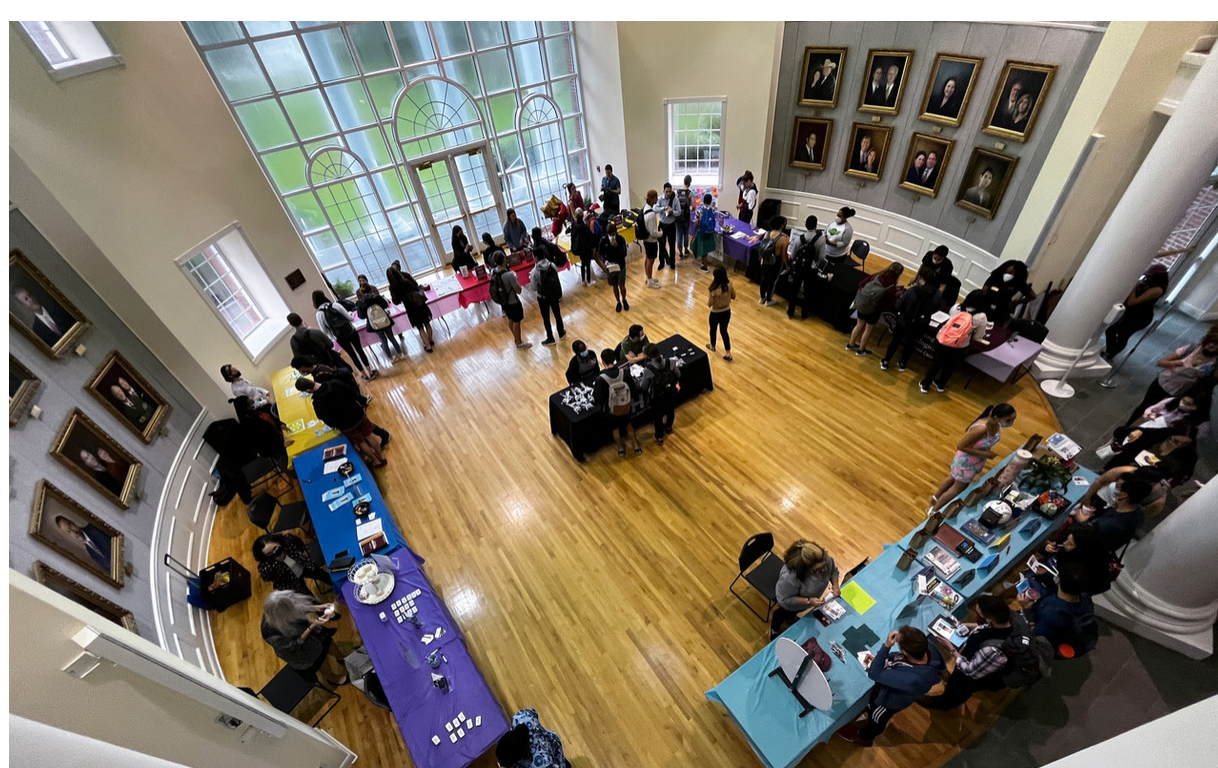
Students attended FSU Law's 2021 Wellness Fair on October 6.

Last week, FSU Law's Office of Student Advancement hosted a Wellness Fair as part of Wellness Week 2021. The event focused around the nine dimensions of wellness and included food, fun activities, free flu shots for students, and opportunities to learn about wellness-related resources on campus. The fair included partners from main campus—FSU Counseling & Psychological Services, Green Dot, FSU Student Resilience Project, The Center for Health Advocacy & Wellness, and FSU Health Services—as well as law school offices and student organizations. It was one of many Wellness Wednesday events that the Office of Student Advancement has hosted for students this semester. Other events have included a journaling picnic on the Green, a cooking session that featured easy-to-prepare, healthy tailgate recipes, a session with attorney and best-selling author Brian Cuban, yoga in the Rotunda, and a session with therapy dogs on the Green. The office also hosts a wide variety of wellness events outside of the Wellness Wednesday series, including popular sessions on Personal Resilience & Productivity through the Raising the Bar Professionalism+ Program. In addition, many student organizations have hosted and are planning events that encourage wellness among the student body. The law school is committed to promoting healthy living, stress management, and wellness habits that will help students during law school and beyond.