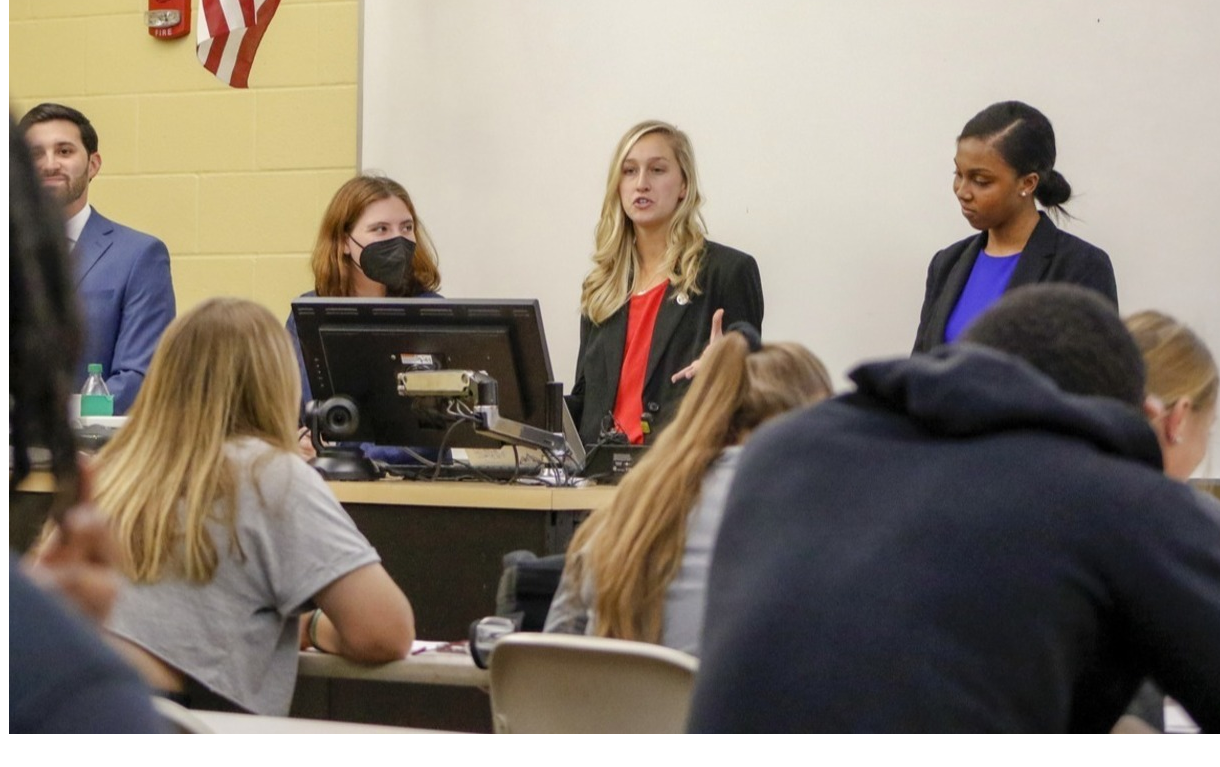
Business Law Clinic students presented to student-athletes in October

In October, students in FSU Law's Business Law Clinic made timely educational presentations on name, image, and likeness endorsements to FSU student-athletes in their Student Development & Leadership classes. The presentations allowed law students to educate student-athletes on their general rights and responsibilities under a Florida statute and NCAA new policy that took effect in July allowing college athletes to benefit from the use of their name, image, and likeness (NIL). The presentations focused on basic information athletes should consider before entering a contract under the NIL rules and used case studies to enforce concepts.