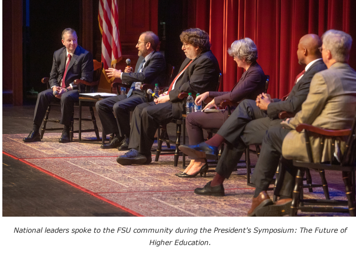
National leaders spoke to the FSU community during the President's Symposium: The Future of Higher Education.