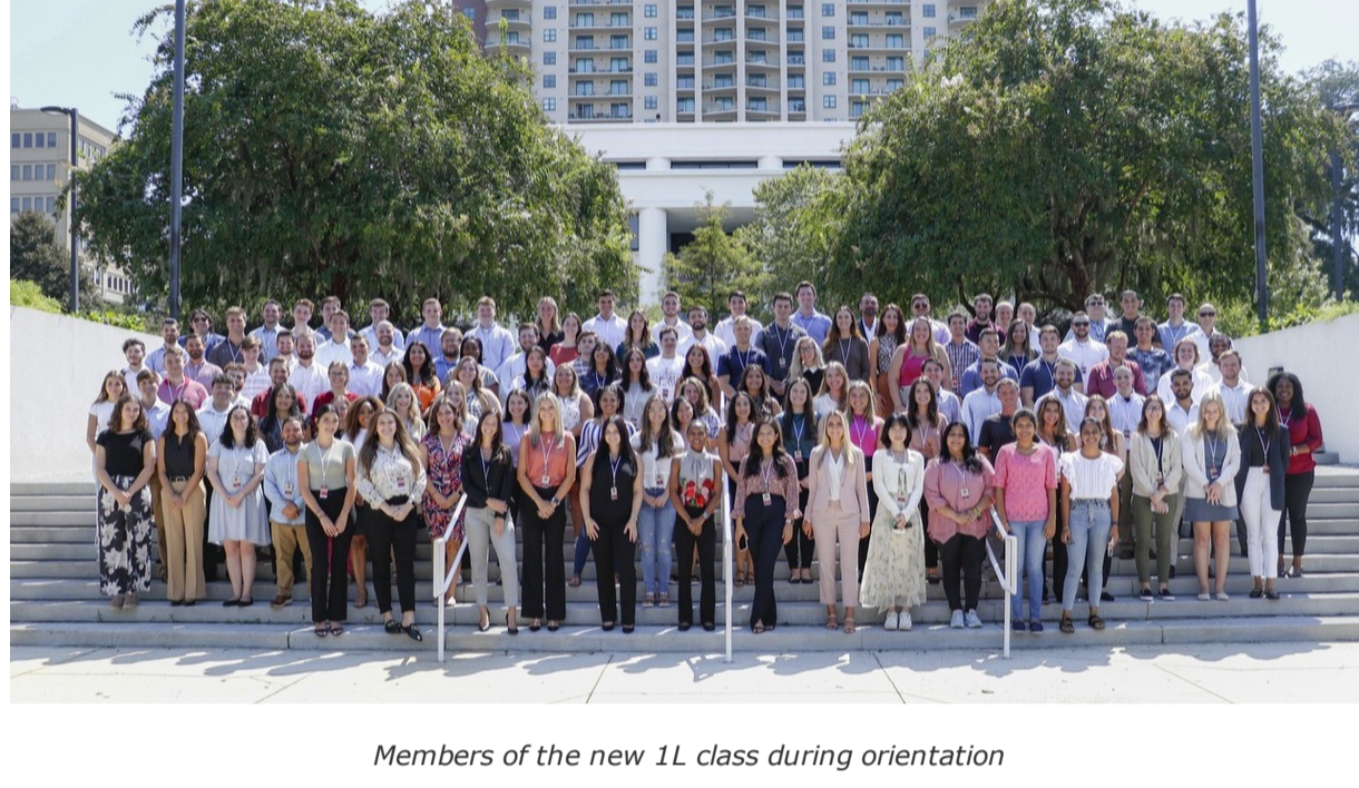
Members of the new 1L class during orientation

FSU Law is excited to have an extremely accomplished new 1L class on campus! The class of 2025 has a record high median LSAT score and undergraduate GPA, at 165 and 3.83, respectively. Students bring remarkably diverse backgrounds and experiences to FSU Law, thereby enriching the classroom experience for everyone. The 1L class is relatively small at 114 students, they hail from 22 different states and 14 countries, and range in age from 20-42. Students graduated from 49 undergraduate institutions, with 30 different majors, and earned 12 advanced degrees prior to law school. More than 34% of the class self-reported as ethnically/racially diverse, 75.7% are first-generation law students, and three members of the class have served in the military. Students have traveled abroad to more than 110 countries and speak almost 20 languages in addition to English. Their interests range from tennis to paleontology to video games. In addition, two of the students are a married couple, one student is a new mom to an infant, and another student was a scholarship athlete on a university track team. FSU Law professors and administrators are looking forward to building relationships with the new 1Ls.