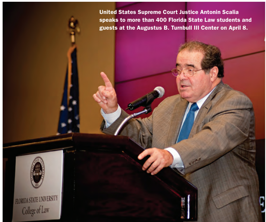
United States Supreme Court Justice Antonin Scalia speaks to more than 400 Florida State Law students and guests at the Augustus B. Turnbull III Center on April 8.

The Supreme Court justice acknowledged the argument that originalists are conservative in ideology while those who favor a “living Constitution” are liberal