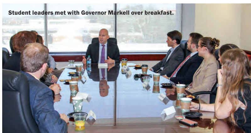
Student leaders met with Governor Markell over breakfast.