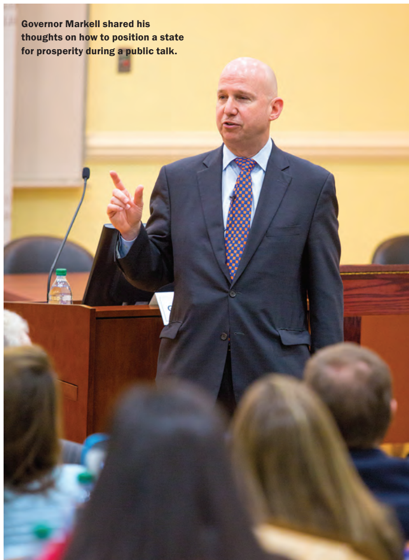
Governor Markell shared his thoughts on how to position a state for prosperity during a public talk.

To promote job creation, Markell said that we must invest in necessary skills and engage with the rest of the world. He also pressed for better education programs and additional resources for those who want to enter the workforce right after high school. After his remarks, students engaged with Governor Markell in a thoughtful Q&A session.