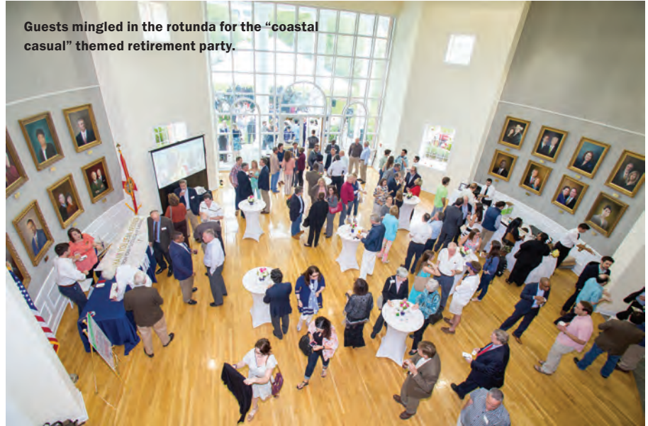
Guests mingled in the rotunda for the “coastal casual” themed retirement party.