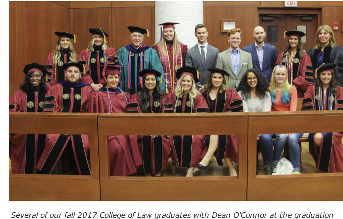
Happy New Year from the FSU Law family! We are all optimistic about 2018

and what we will accomplish. As we prepare for the spring semester, which will