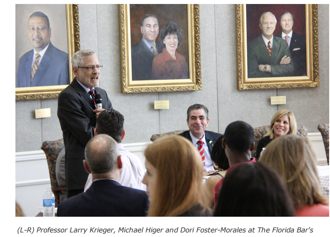
On February 20, we welcomed The Florida Bar for a town hall on lawyer mental

health and wellness with law students, lawyers and experts on the topic.