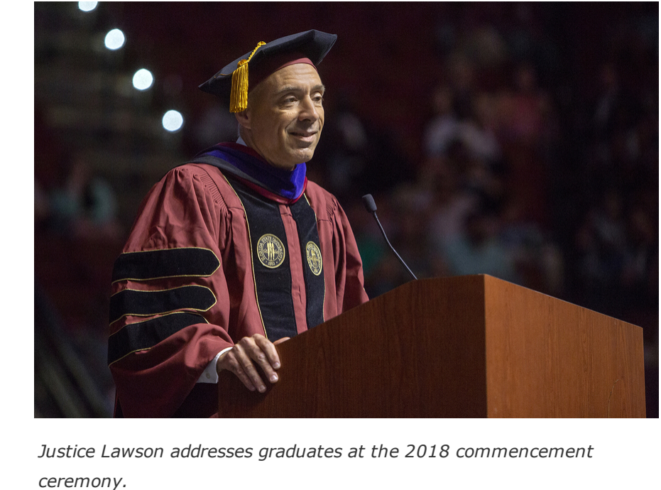
From the Dean