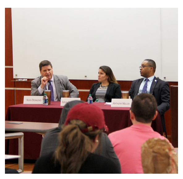
Raising the Bar Professionalism Program panel on mentorship in March 2018

A new Academic Programs Office now provides enhanced student academic support and advising. We assist students with course selection and provide resources to strengthen academic success, effective writing and bar preparation.