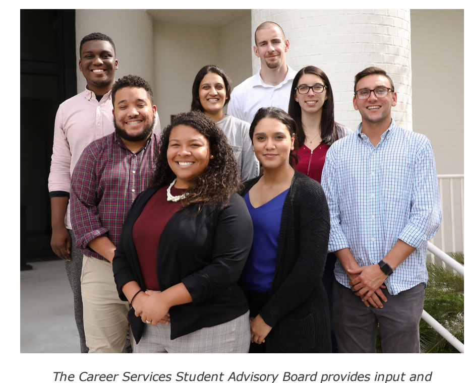
suggestions to our Career Services Office. Our Career Services and Professional Development team relies on valuable

input from alumni and other employers about our career services efforts.