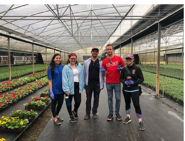
Student participants in the 2019 Alternative Spring Break Program