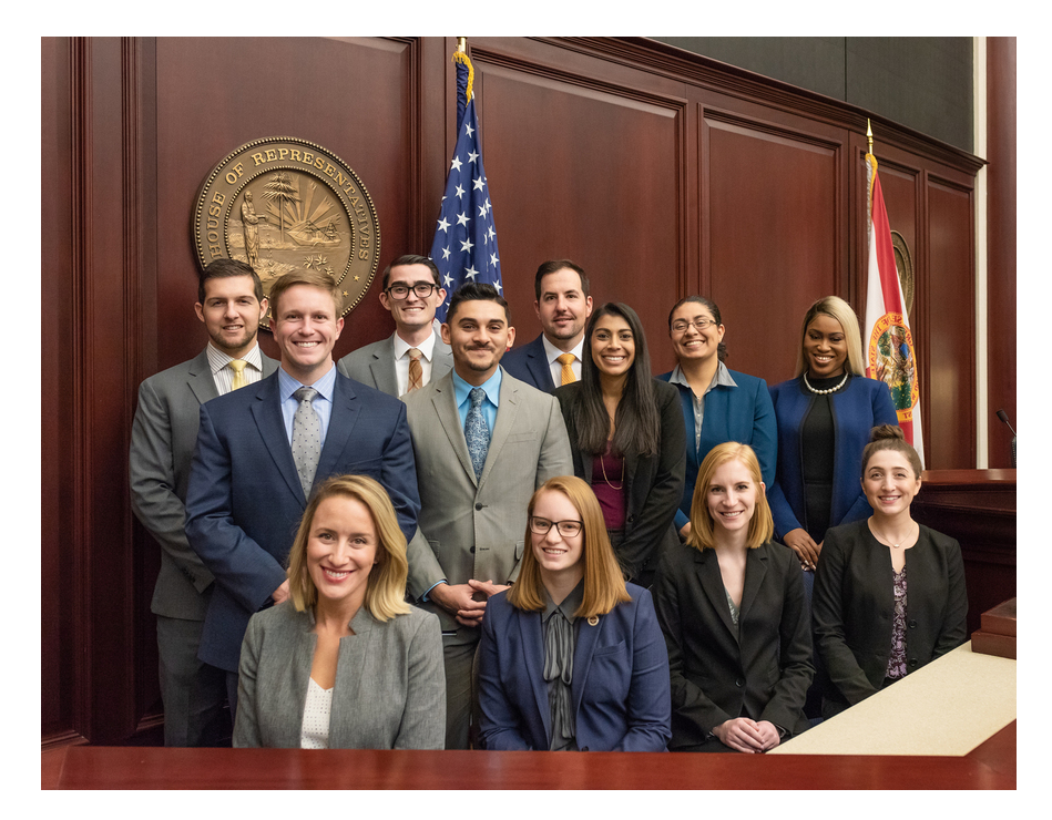
This year, 10 of the 12 Florida House of Representatives legislative interns were FSU Law students.