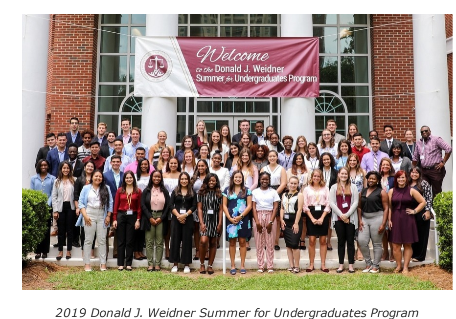
participants Last week, we welcomed 60 extremely bright, enthusiastic undergraduate