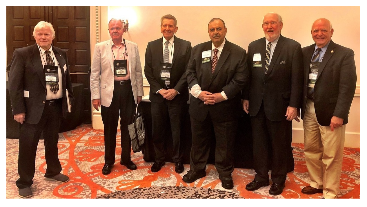
Several FSU Law Class of 1969 members who were honored for 50 years of Florida Bar membership and dedication to the practice of law