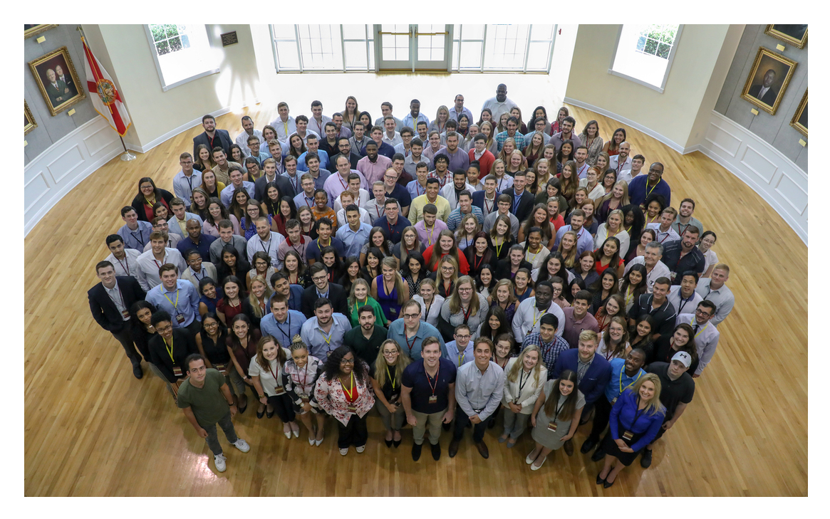
We welcomed new FSU Law students to campus during this week's orientation.