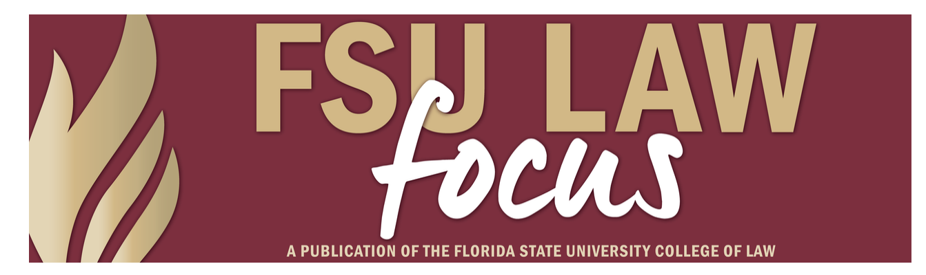
January 24, 2020