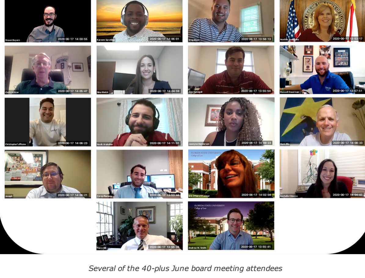
This was the second fully virtual meeting the board has conducted and it

provided opportunities for all of the board to meet without the difficulties