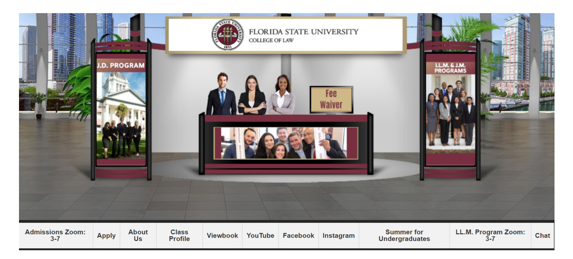
FSU Law virtual booth for LSAC recruiting forums