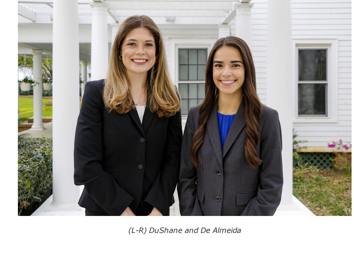
national moot court competition! On March 20, the team won the 2021 Seigenthaler-Sutherland Cup National First Amendment Moot Court

Competition, which took place virtually March 19-20 and was hosted by