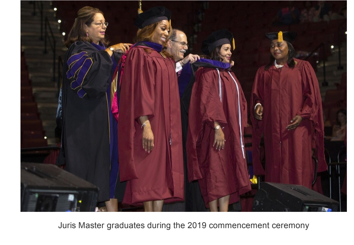
When we launched our online Juris Master Program several years ago, we

could not have anticipated the huge growth it would see in its first years. This