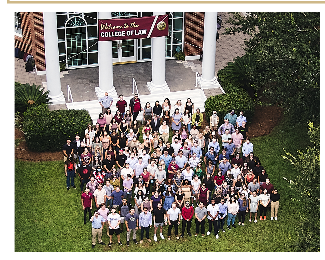
This week, we began the fall 2021 semester and welcomed students back to campus