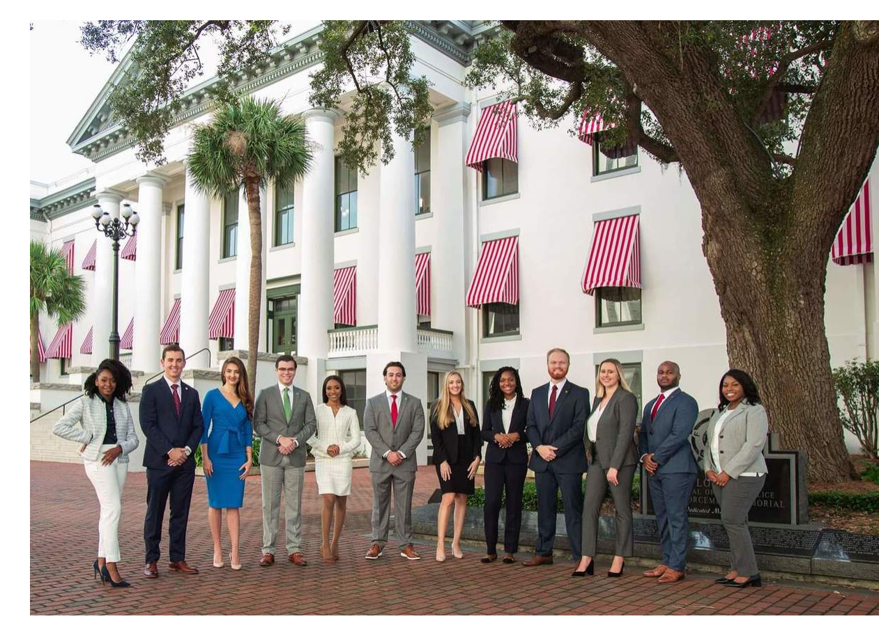
We are delighted to report that seven FSU Law students have been selected for the