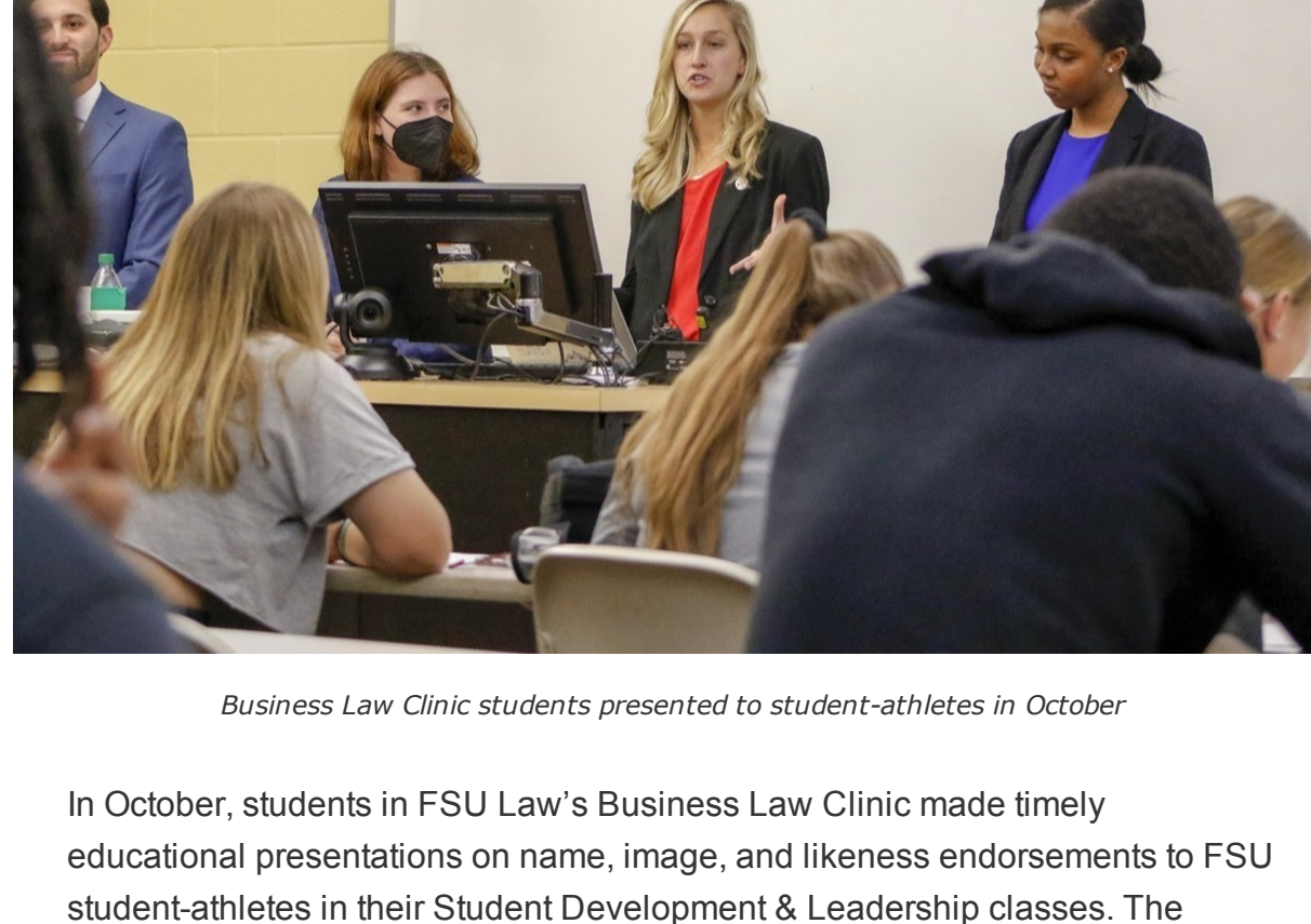
rights and responsibilities under a Florida statute and NCAA new policy that took effect in July allowing college athletes to benefit from the use of their

into the nation's electric grid, transportation electrification, oil and gas