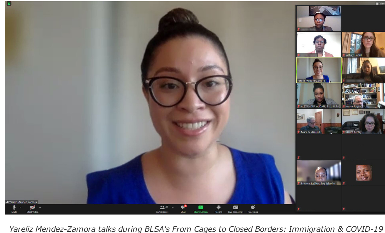
On January 18, FSU Law's Black Law Students Association (BLSA) hosted a Zoom panel, From Cages to Closed Borders: Immigration & COVID-19. The

BLSA Presents Panel on Immigration & COVID-19