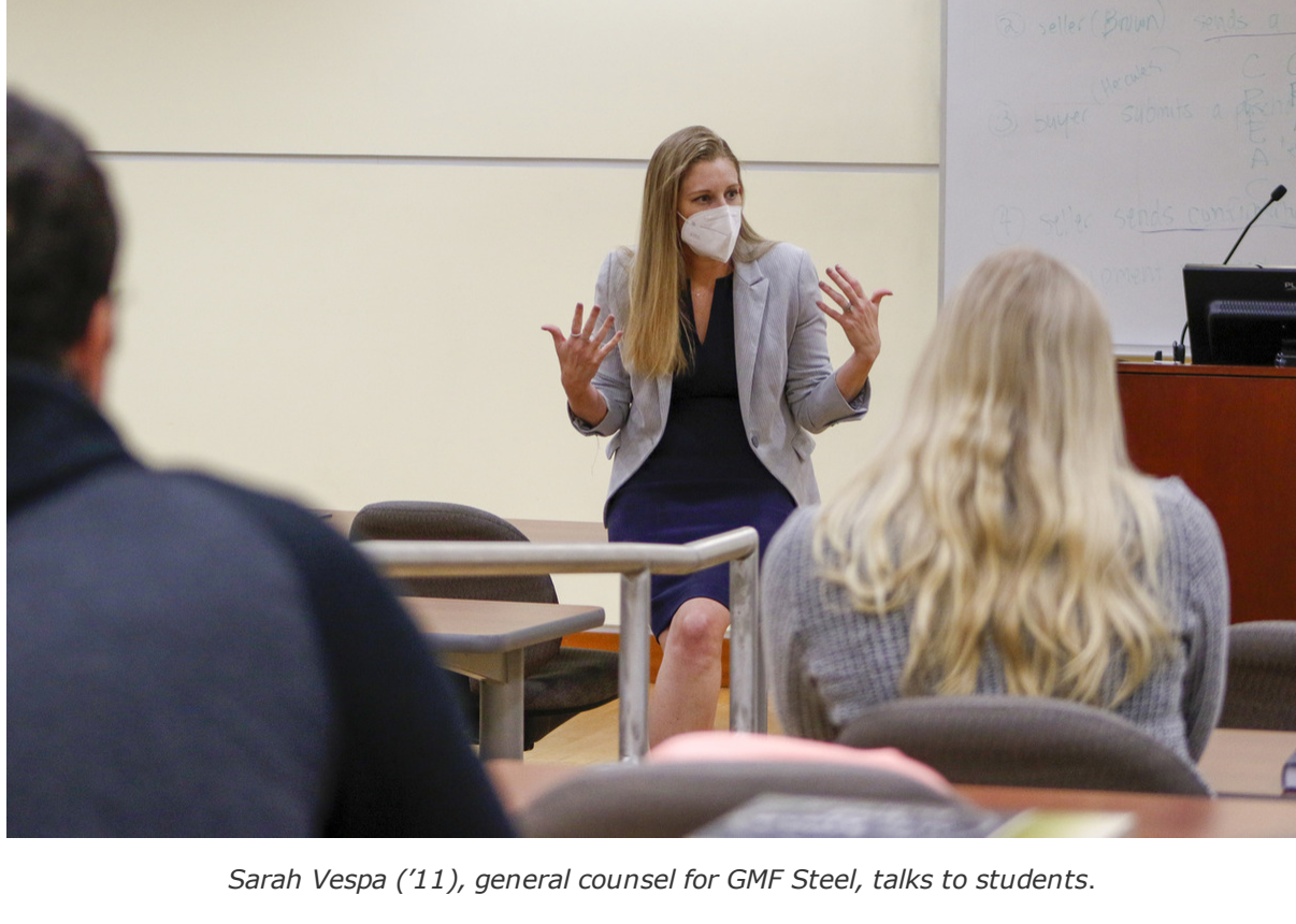
several alumni during the past few weeks and looks forward to hosting more

been able to speak to students in person and virtually. FSU Law welcomed