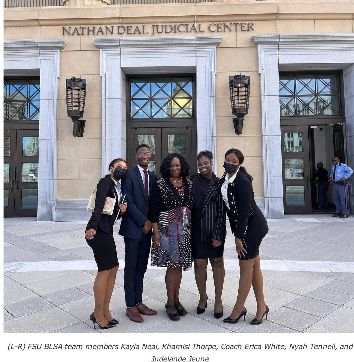
Competition during the Southern Region of the Black Law Students Association Convention. The 2022 competition took place February 24-26, in

For the third year in a row, FSU Law's Black Law Students Association (FSU