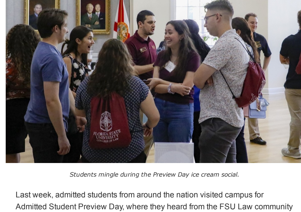
joining alumni and current students on Thursday evening for a reception and

about the world of opportunities available to them at FSU College of Law. After