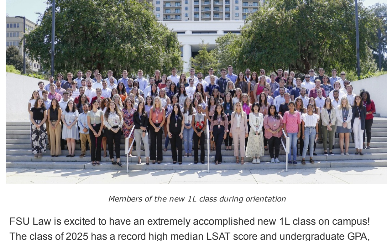
at 165 and 3.83, respectively. Students bring remarkably diverse backgrounds and experiences to FSU Law, thereby enriching the classroom experience for

everyone. The 1L class is relatively small at 114 students, they hail from 22 different states and 14 countries, and range in age from 20-42. Students graduated from 49 undergraduate institutions, with 30 different majors, and earned 12 advanced degrees prior to law school. More than 34% of the class self-reported as ethnically/racially diverse, 75.7% are first-generation law students, and three members of the class have served in the military. Students have traveled abroad to more than 110 countries and speak almost 20 languages in addition to English. Their interests range from tennis to paleontology to video games. In addition, two of the students are a married couple, one student is a new mom to an infant, and another student was a scholarship athlete on a university track team. FSU Law professors and administrators are looking forward to building relationships with the new 1Ls. Alum Profile: Celeste N. Gaines ('15)