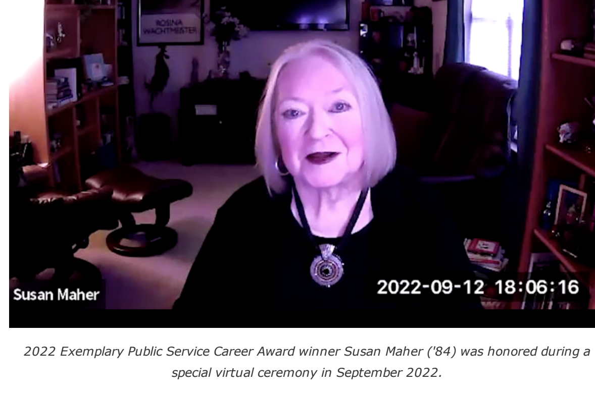
recognizing alumni who have dedicated their careers to public service, the award honors people who have demonstrated exceptional character, integrity, leadership, humility, and professionalism, as well as the highest regard for ethics. The award

Call for Public Service Award Nominations