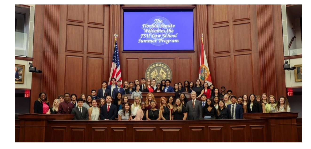
Today is the last day of our 2023 Donald J. Weidner Summer for Undergraduates

2023 SUG participants in the Florida Senate chambers