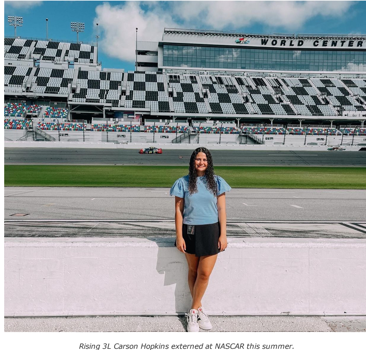
FSU Law students have obtained valuable, hands-on work experience this summer through externships located around the country and in London. About 60 students

Students Gain Valuable Experience Through Summer