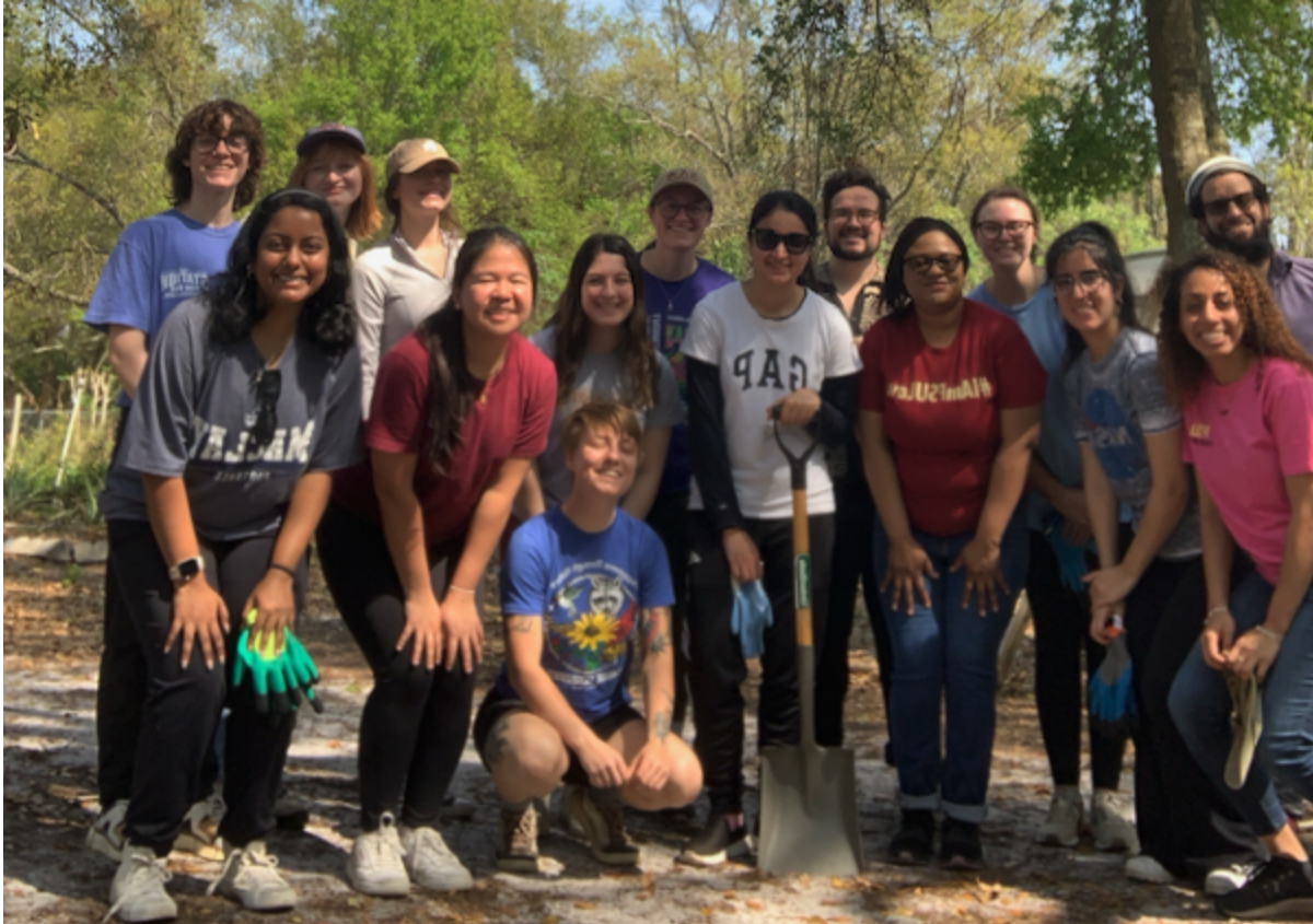
1L-3L JD students and an LL.M. student on the 2025 Alternative Spring Break trip.

Last week, students journeyed to Apopka, Florida, for the 2025 Alternative Spring Break Program. Visiting the Farmworkers Association of Florida , the students had a unique and impactful learning experience, exploring the legal and human dimensions of critical issues such as environmental justice, immigration policies, farmworkers' rights, and human trafficking.